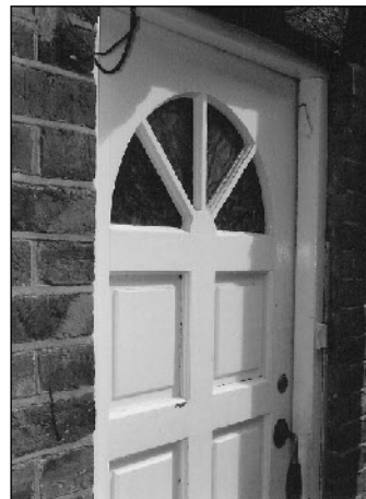
Fan light in the door when it should be over the door frame.

The Society's message is that the owners of locally listed buildings should look carefully at the character and style of their windows and, where replacement is essential, insist that manufacturers or suppliers provide windows that closely follow the style and appearance of what exists or what had existed originally.