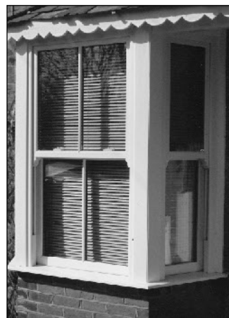
A good UPVC replacement matching the original.