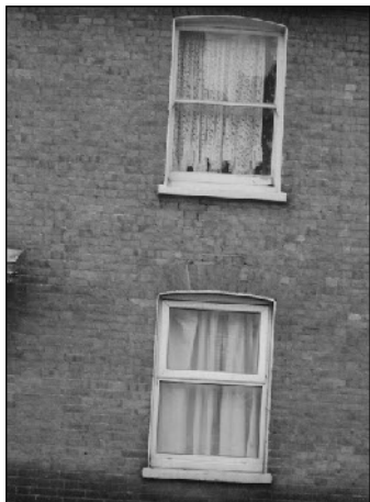
Change from original timber sash to top hung UPVC on the ground floor – before and after.