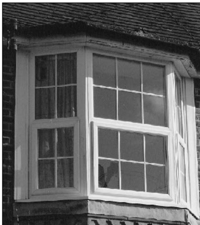
Top hung UPVC with false glazing bars replace original sash.