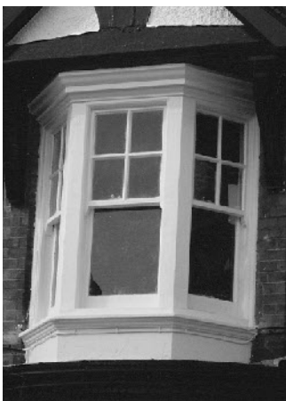
The best approach is, wherever possible, to repair and repaint the existing window.