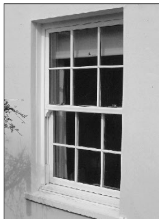
An excellent facimile in UPVC.